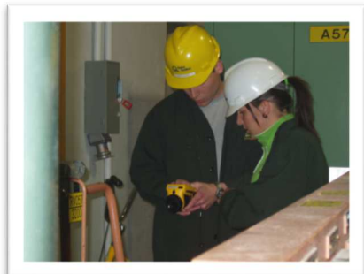
Onsite Customer Training