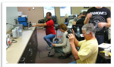
Hands on learning using "real world" in class labs